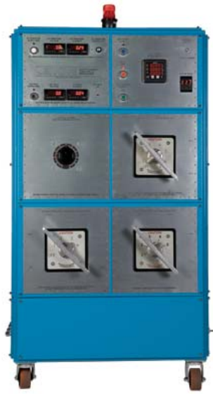
TDS with a new Jenkins Motor Test System