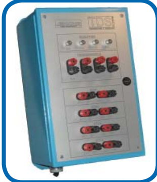
Temperature & Vibration Module