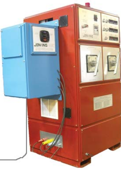
TDS Add-on Module on an existing Motor Test System